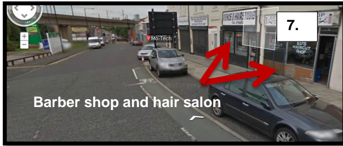
Barber shop and hair salon