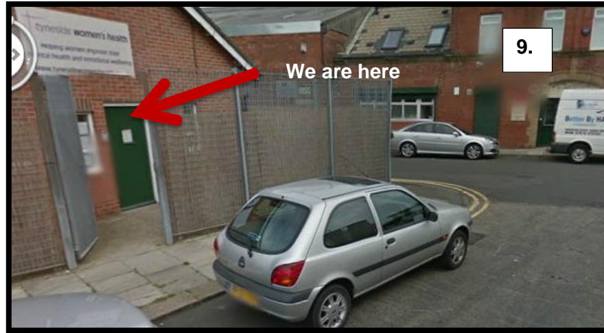
We are here